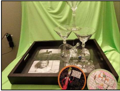
Grace McElhinney, Gift Table Convener