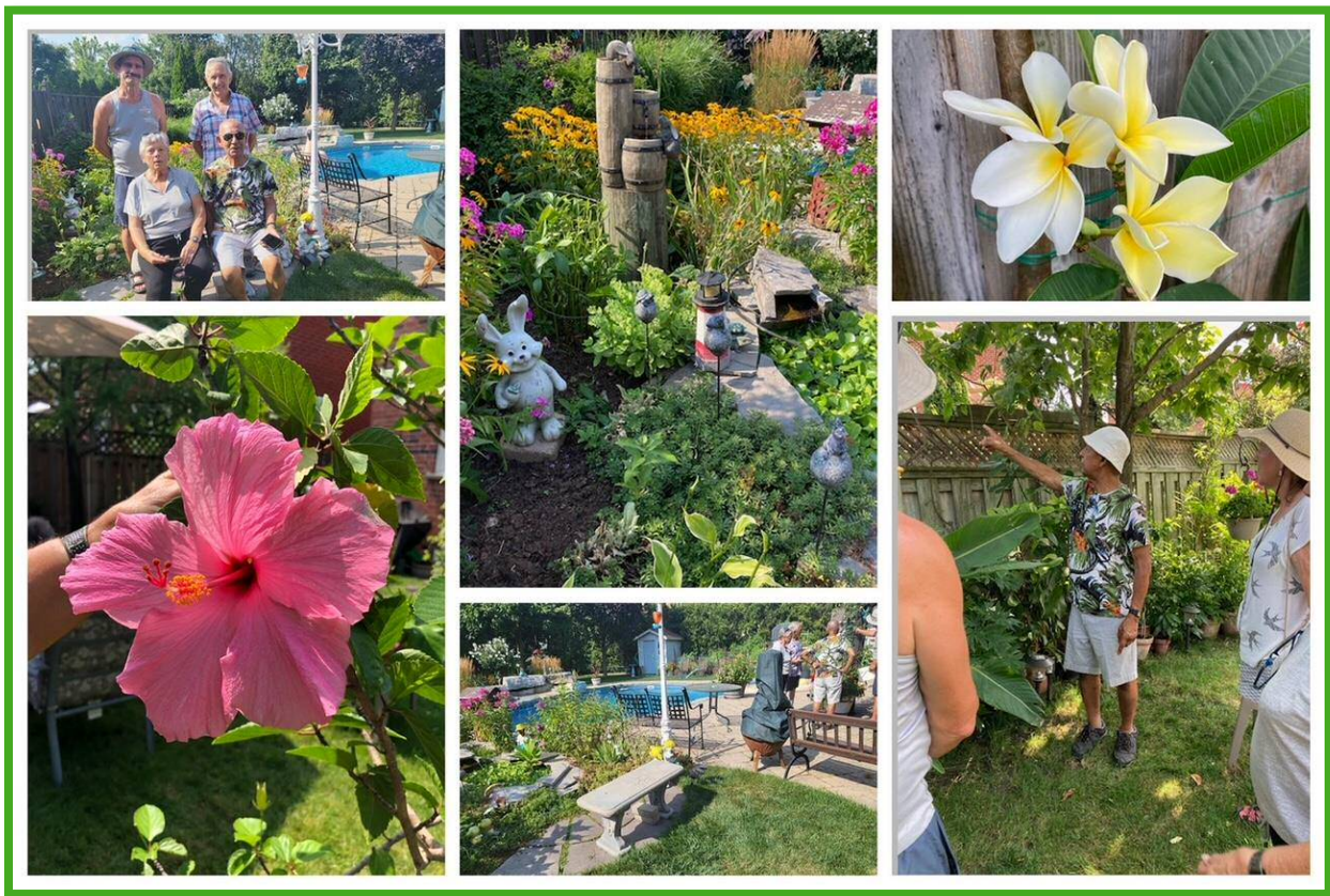
Two smaller pictures taken by Steve Fenech Garden Tour pictures taken by Grace Nelham