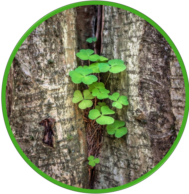
Clover picture