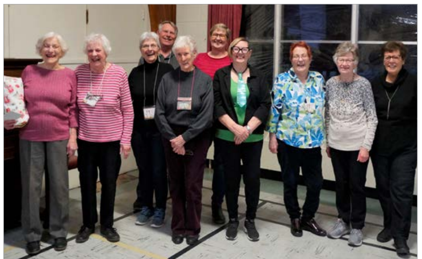
Our board members