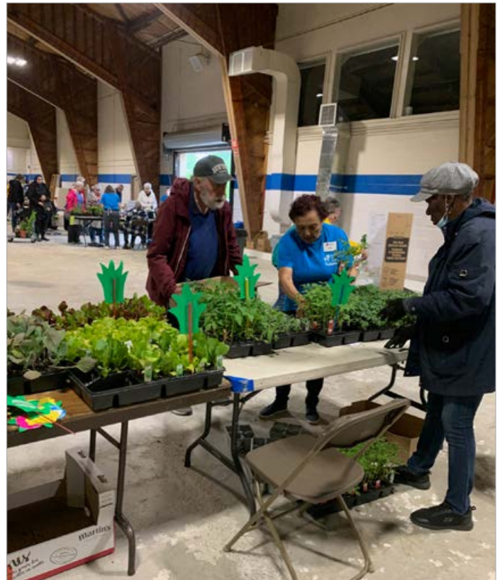
A great selection of member-grown and locally-grown vegetable plants