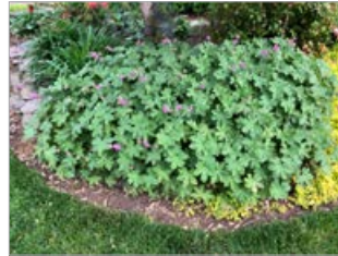
Wild Geranium ( Geranium maculatum )