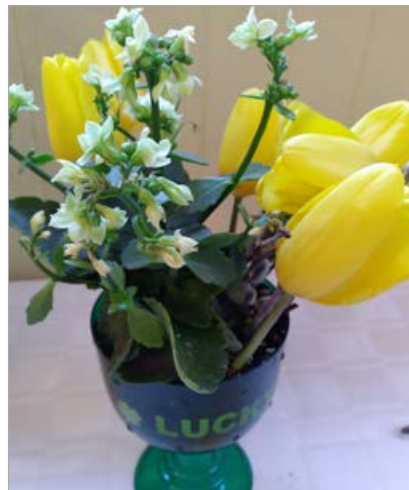
Floral Competition