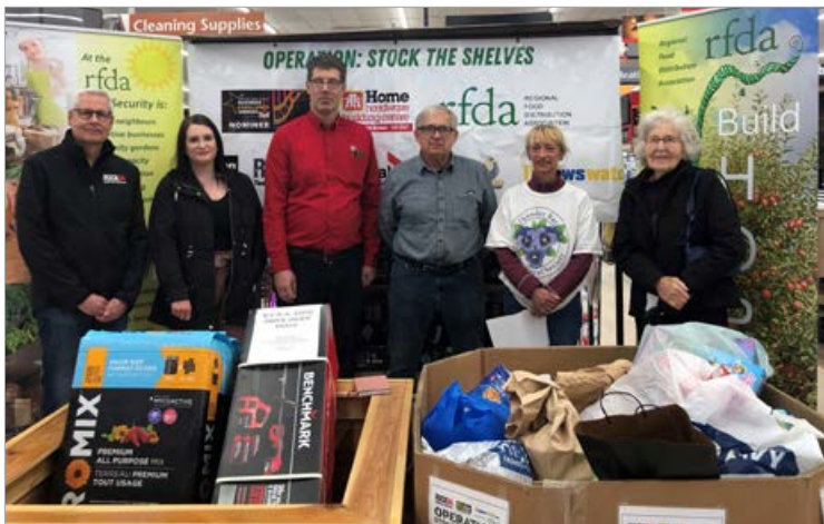
RFDA Food Drive Collaboration – April