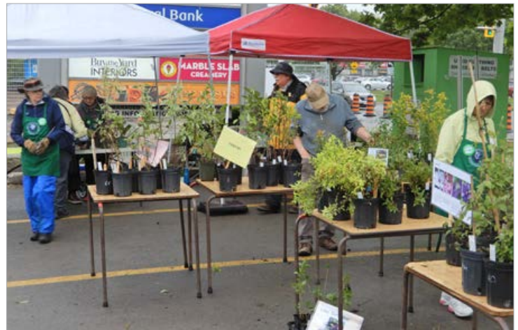
Plant Sale