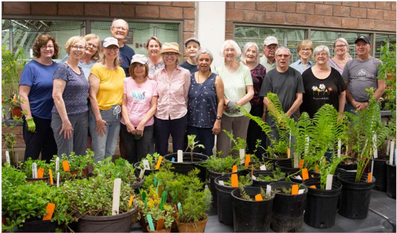
Some of the many volunteers at the Paris Horticultural Society's Plant Sale