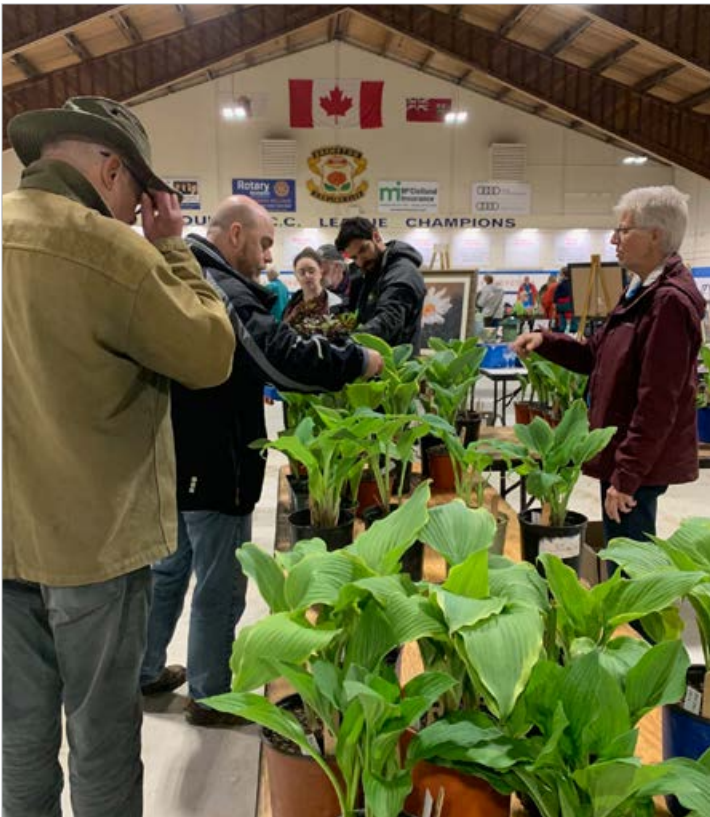
Ever popular hostas