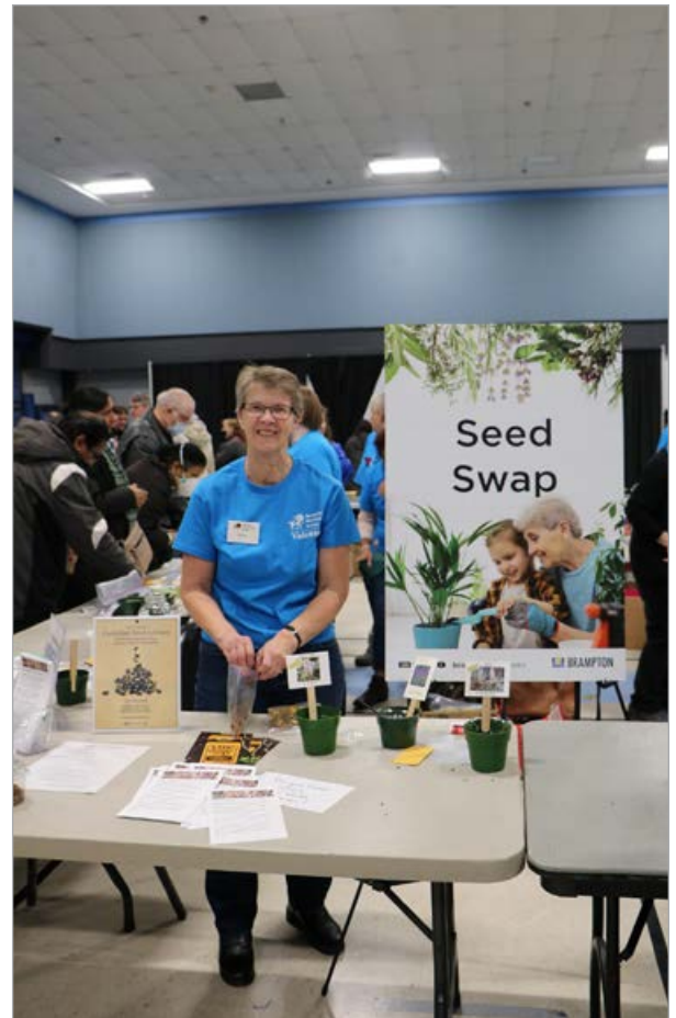
The Seed Swap and Seed Sale was a great success.