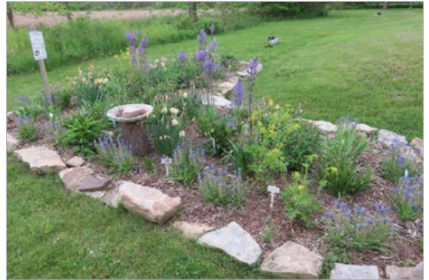
Pollinator Garden at Erland Lee Museum Grounds

All volunteers are very much appreciated for helping with all of the club's endeavours. The Club executive look forward to working with all the new and old members!