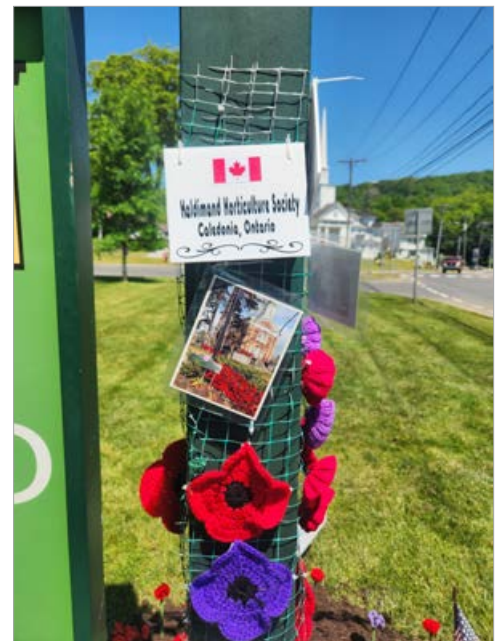
Photo by Kathi Barringer from the New Milford, Connecticut, USA Garden Club. They were so thrilled that we participated in their "International" poppy display.