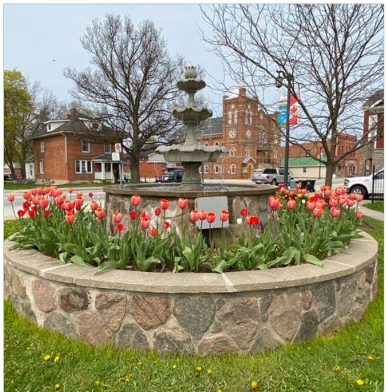
The fountain now has a tulip at the top.