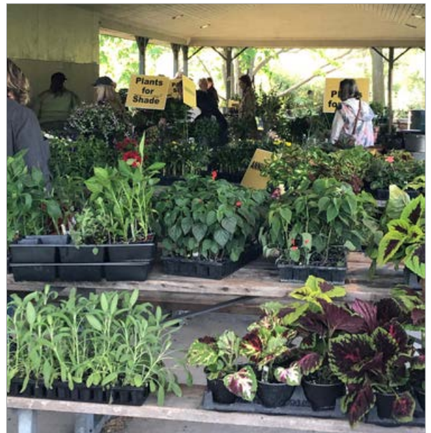
Plant Sale