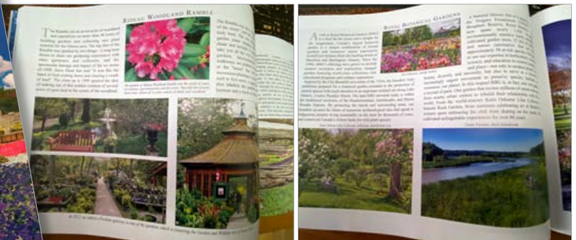
Rideau Woodland Ramble in Burritt's Rapids, winner of the Canada 150 Destination Garden Centre.

They have amazing hostas and rare perennials for sale.