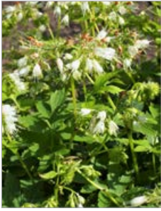
Virginia Waterleaf ( Hydrophyllum virginianum )