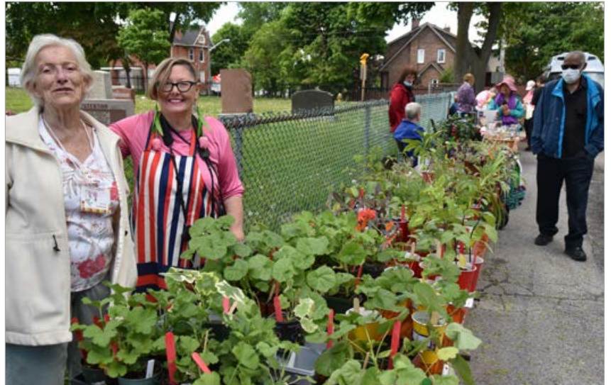
Our first outdoor plant sale

Over the past year, we have visited Bangkok, Singapore, Buffalo, many gardens in England, followed the Footsteps of the Group of Seven and learned the history of Don Mills, without leaving our chairs. We also learned about: African violets, hydrangeas, pruning, darling dahlias, planting in unusual containers, putting our garden to bed and how to make a wreath. It has been busy and a wonderful learning experience each month. Kudos to our programming committee and our guest speakers.