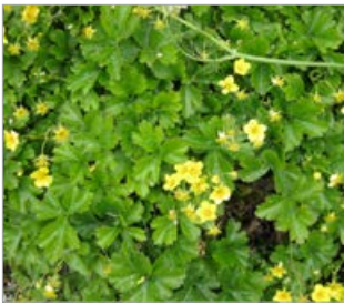
Barren Strawberry ( Waldsteinia fragarioides )