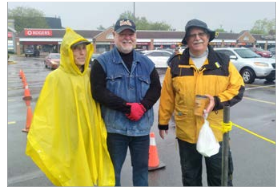
Above: Plant Sale