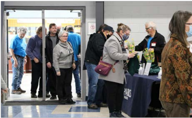
Doors open to what was close to 900 visitors.