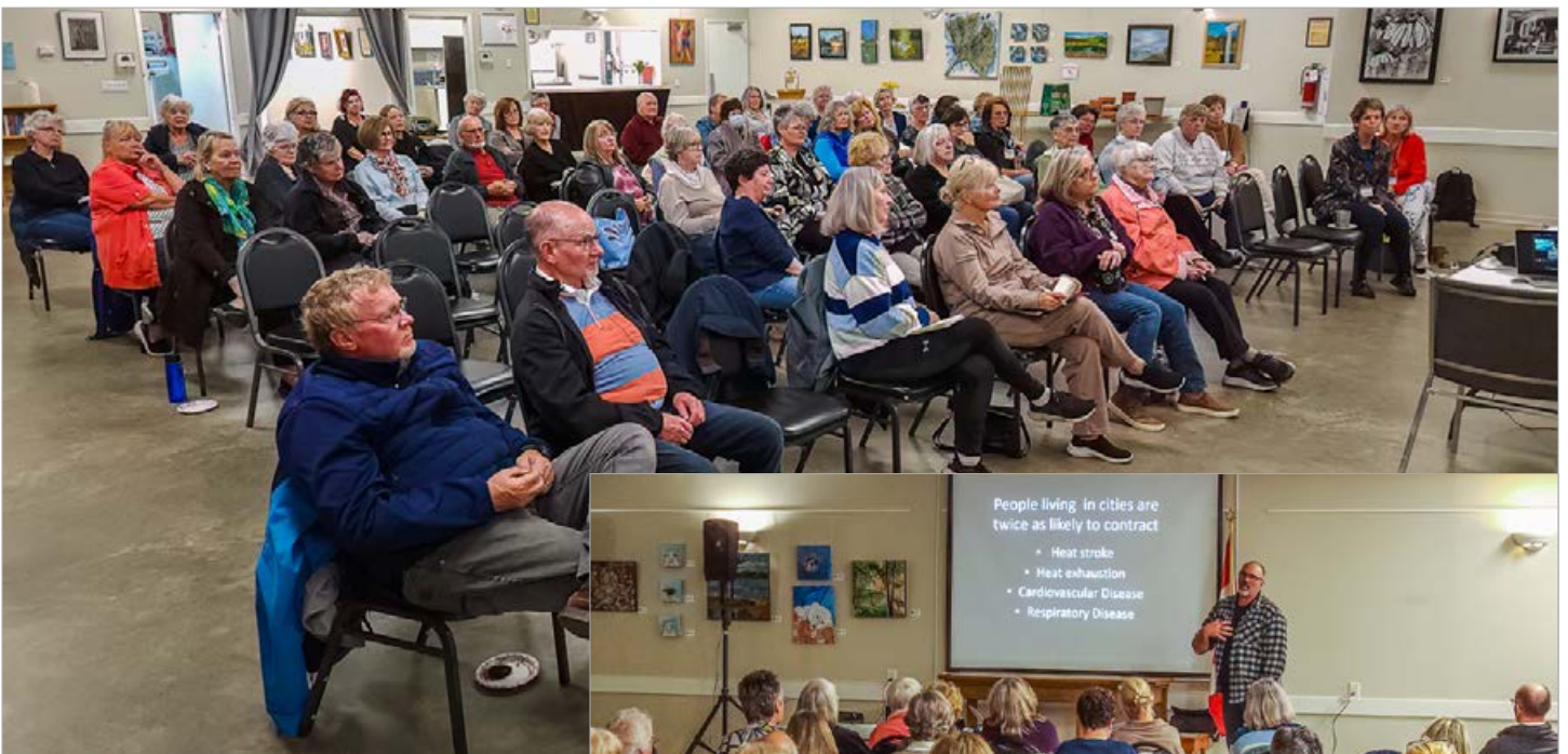
Members enjoying guest speakers at Bath Gardening Club meetings