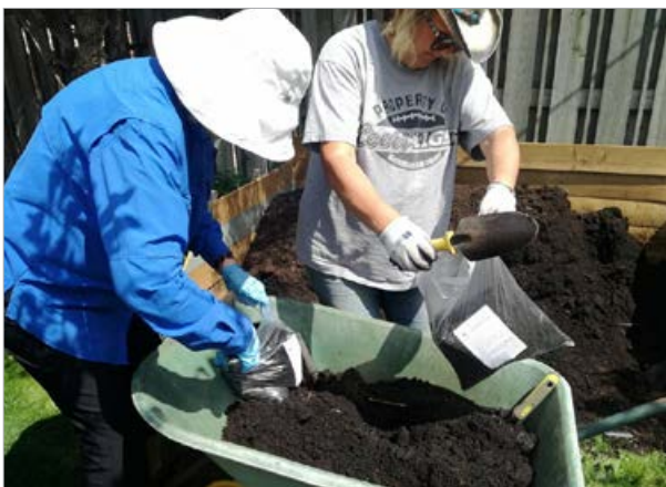
Worm Castings being bagged