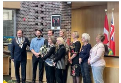
Community Improvement Award

The OHA also awarded the Schomberg Horticultural Society with a Technical Advancement Certificate, awarded to the Society for its implementation of social media, virtual meetings, flower shows, virtual yearbooks and its commitments to keeping society members connected via social media and virtual meetings during the pandemic.