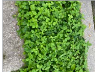
Wild Strawberry ( Fragaria virginiana)