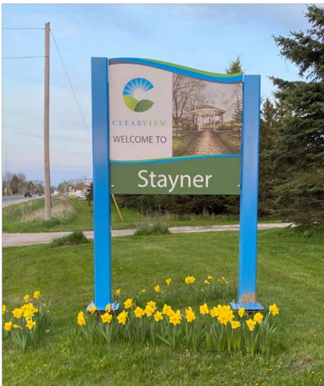
Daffodils welcome everyone to Stayner.

In 1968, the Stayner Horticultural Society planted rose gardens, one at Centennial Park and the other at Station Park. In 1970, the Ontario Horticultural Association urged each horticultural Society in Ontario to plant a "peace" rose bed