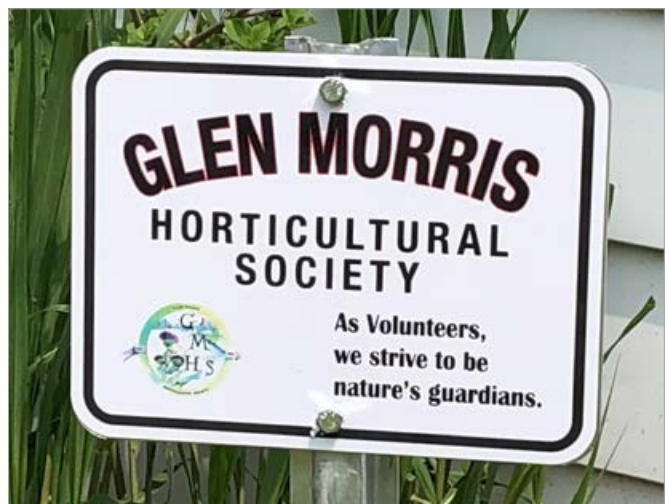
Glen Morris Community Garden Sign