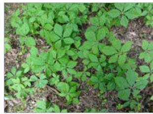
Virginia Creeper ( Parthenocissus quinquefolia )

“If you have a garden and a library, you have everything you need.”