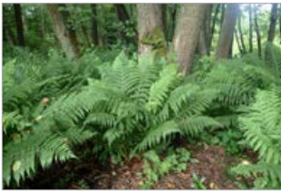
Lady Fern ( Athyrium filix-femina )