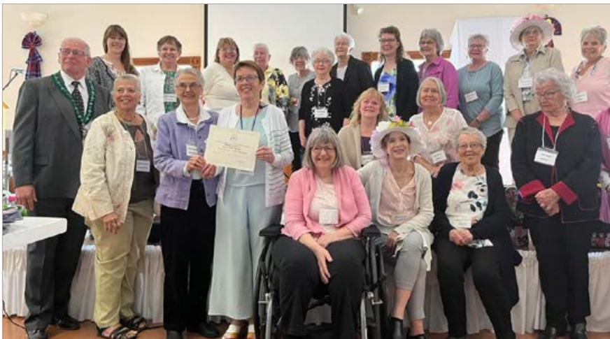
November AGM – Photo by Glenda Villeneuve