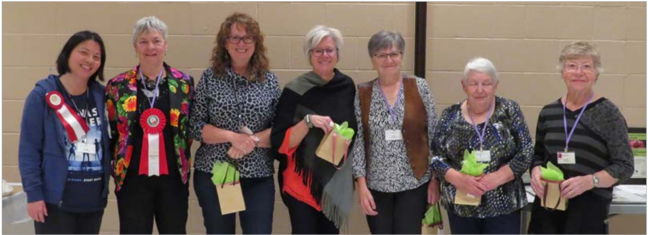
Flower Show Winners