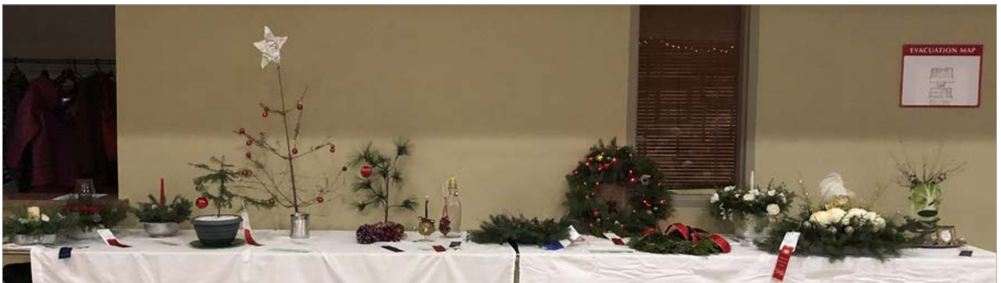
Christmas Flower Show