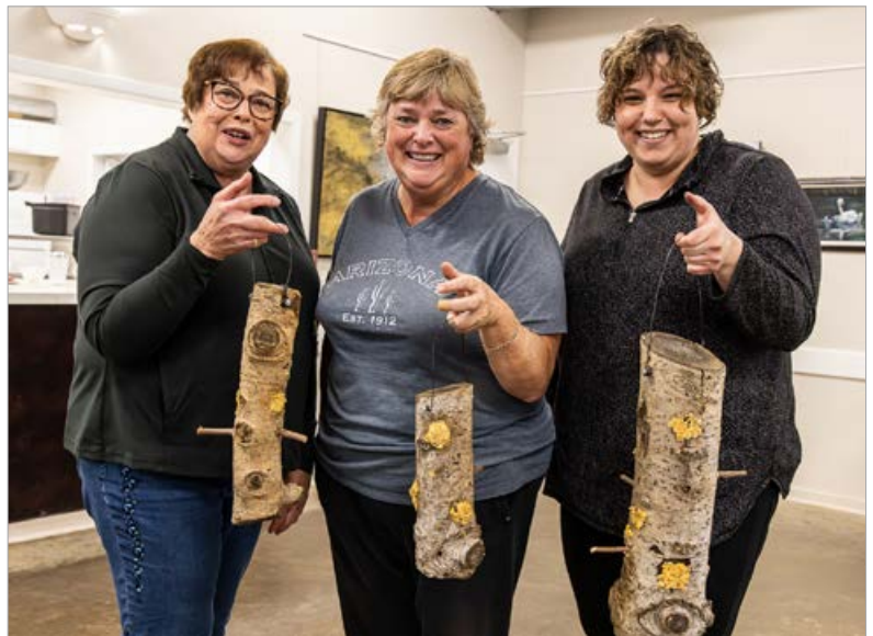
Suet Bird Feeder Workshop