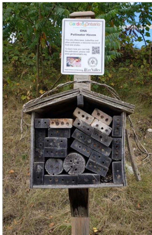
There is no vacancy at the nearby "Bee" hotel