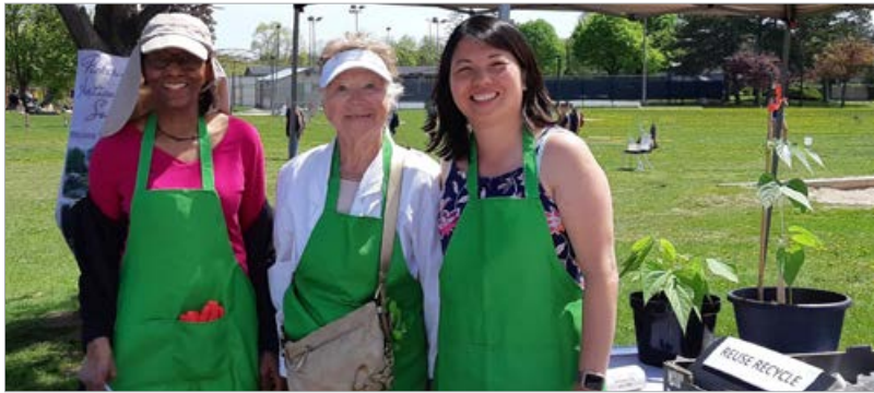
Youth Initiatives

Also, Yvonne Nunes took it upon herself to get the club re-involved with Youth Initiatives. The smile on the kids' faces in their pictures and at the October meeting when they got their certificates was heartwarming. These will continue in 2024.