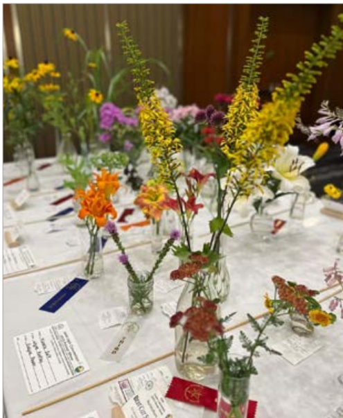
Best in Show – Horticultural Division Best Cut Specimen