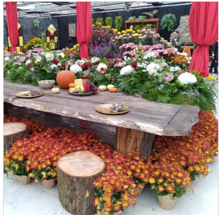
Mum Show