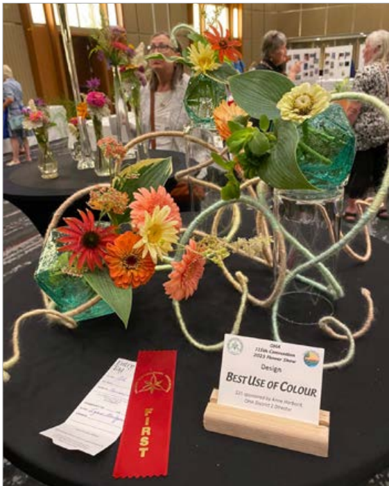
Best Use of Colour – Design Division