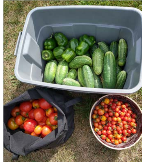
Photos of vegetable harvest

It is good to know that, when help is needed, our neighbors are there, and we care!