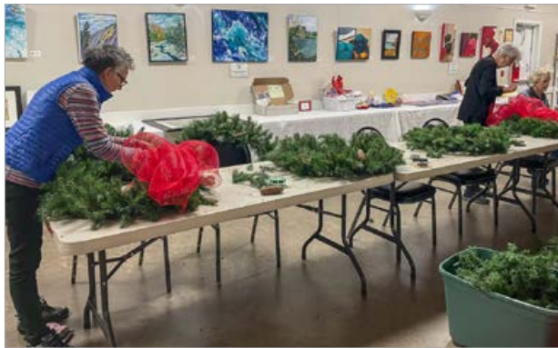
Wreaths and Bows – Photo by Laurie Minorgan