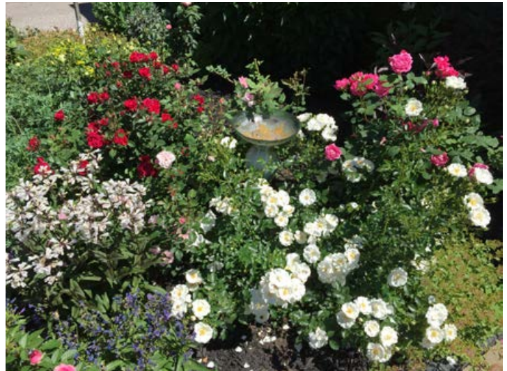
Urban Rose Garden