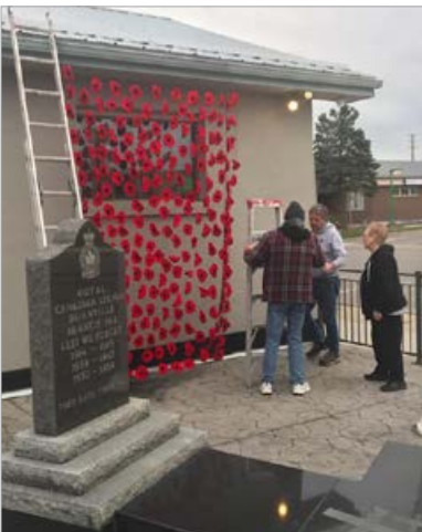
Dunnville Legion Branch#142

While taking a break from monthly meetings in July and August, members of the Board of Directors were still hard at work planning and working on grants and applications. The volunteer weeders were kept busy staying ahead of the weeds! At the end of July, D.H.S. installed two miniature lighthouse features in prominent downtown gardens. They look great and complement the larger lighthouse feature located near the bridge crossing the Grand River.