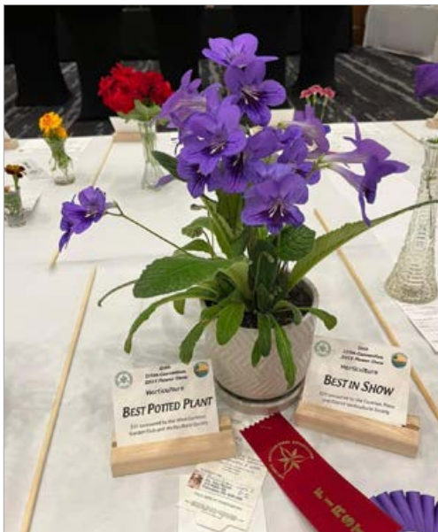
Best in Show – Horticultural Division Best Potted Plant