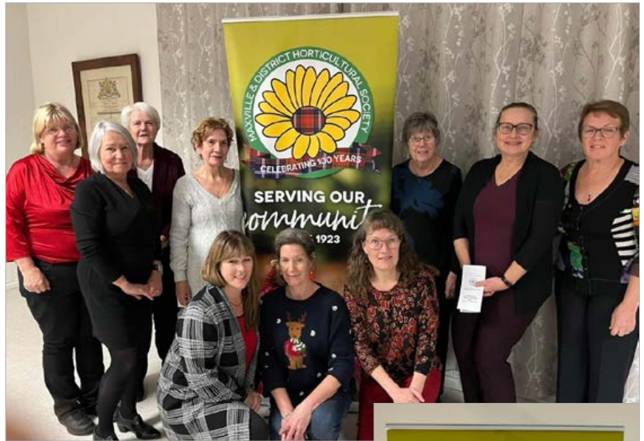
Banner (above and right)