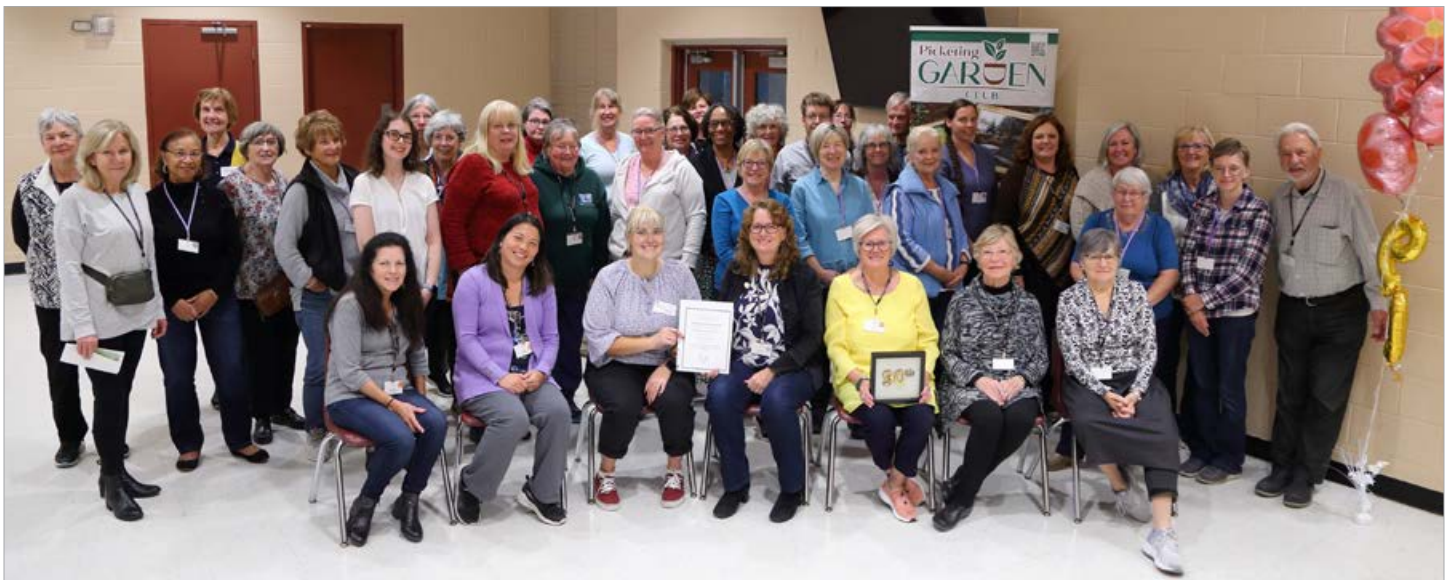
90 th Anniversary Celebration