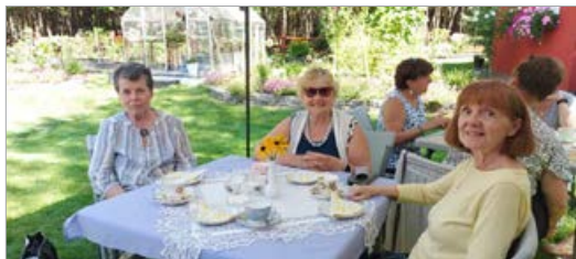
August Tea

Our November 15th AGM was a tribute to our successful year. We reached 102 members and 100 tree seedlings purchased and given with membership. 73 members and guests enjoyed a delicious turkey dinner that was served on beautifully decorated tables. Many hand-crafted door prizes and flower arrangements were handed out. The 2024 Executive and Directors were elected and everyone is looking forward to another amazing year.