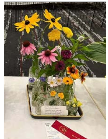
Best in Show – Horticultural Division Best Collection