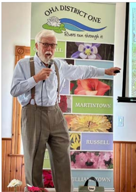
District 1 AGM