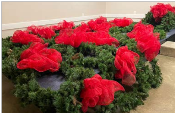
Wreaths and Bows