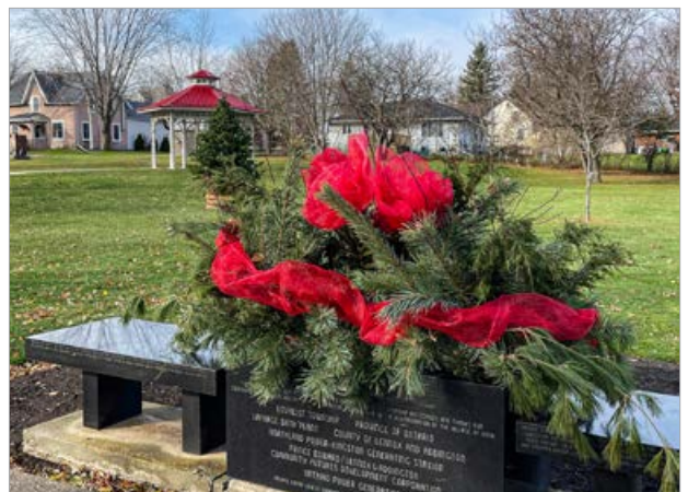
Decorating Bath for Winter