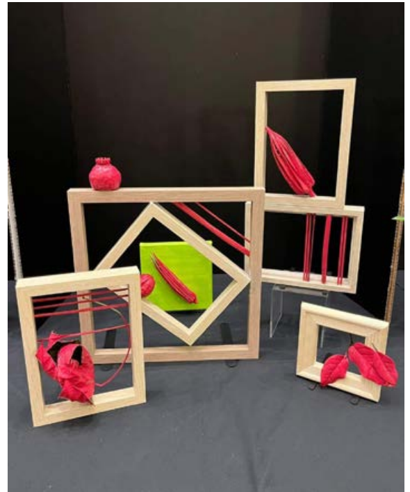
Most Creative– Design Division