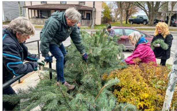
Decorating Bath for Winter