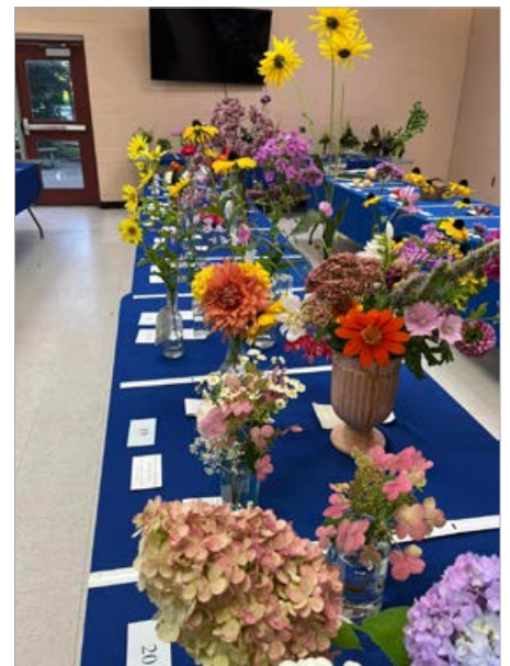
Flower Show