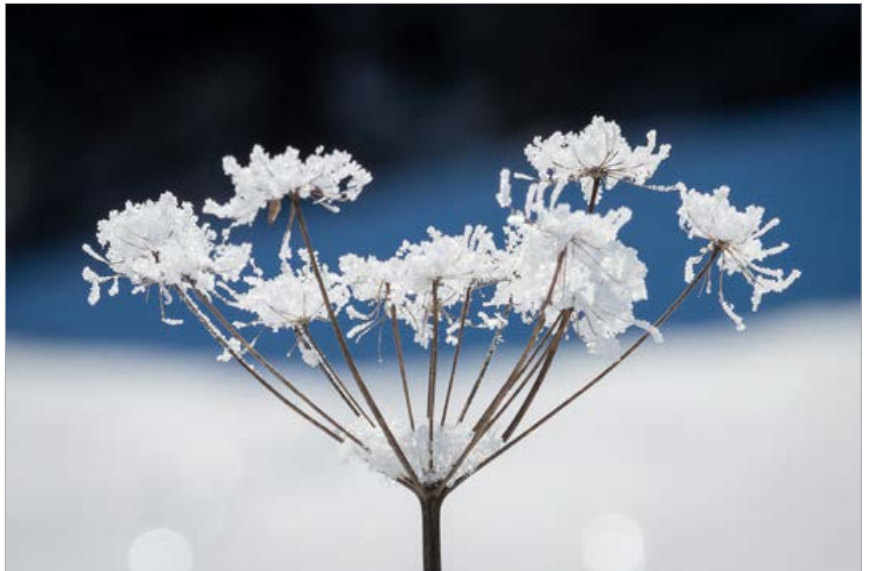
Grand Champion: Chilled Out Larry Champney