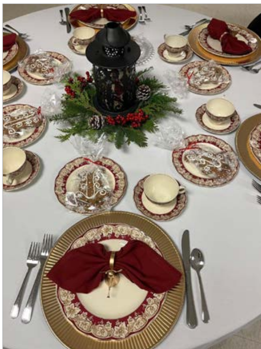
November AGM