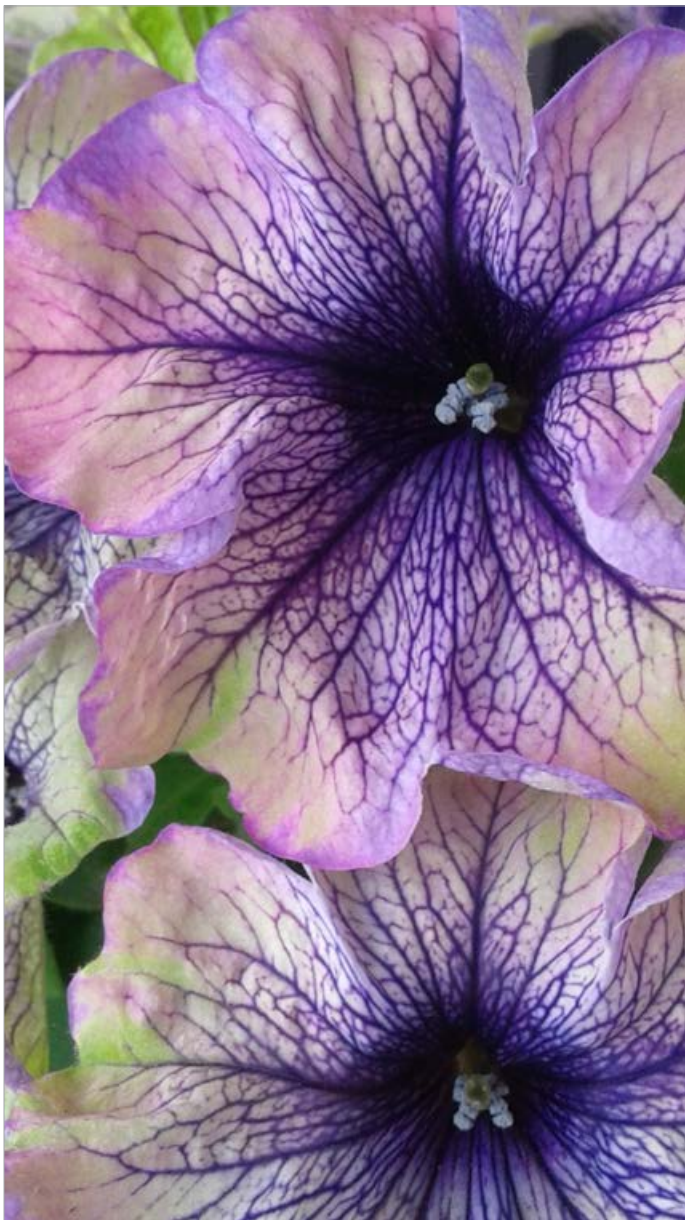
Luba S. #1