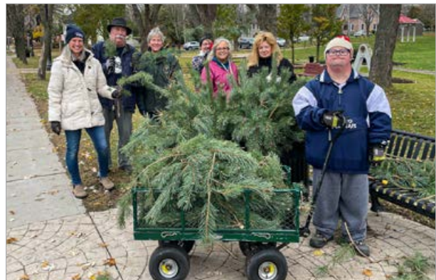
Decorating Bath for Winter