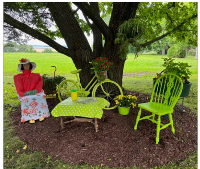
June garden tour