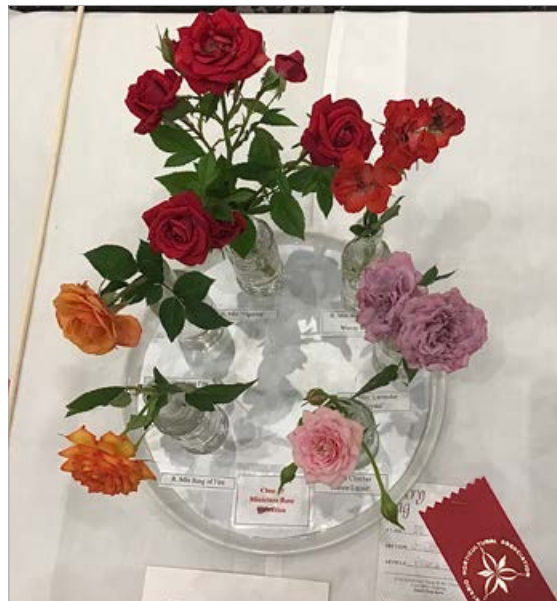
Best in Show – Horticultural Division Best Rose