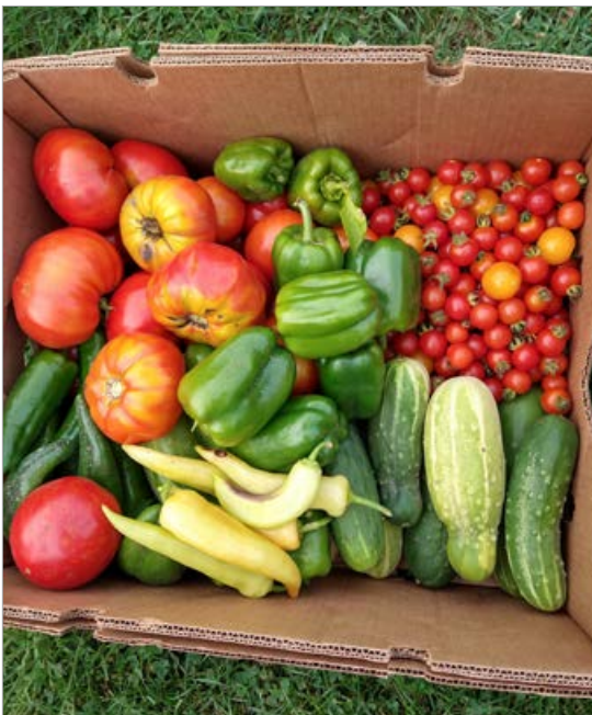
Photos of vegetable harvest