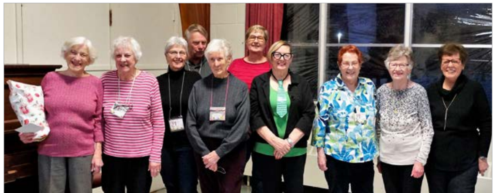
2023 Agincourt Garden Club Board