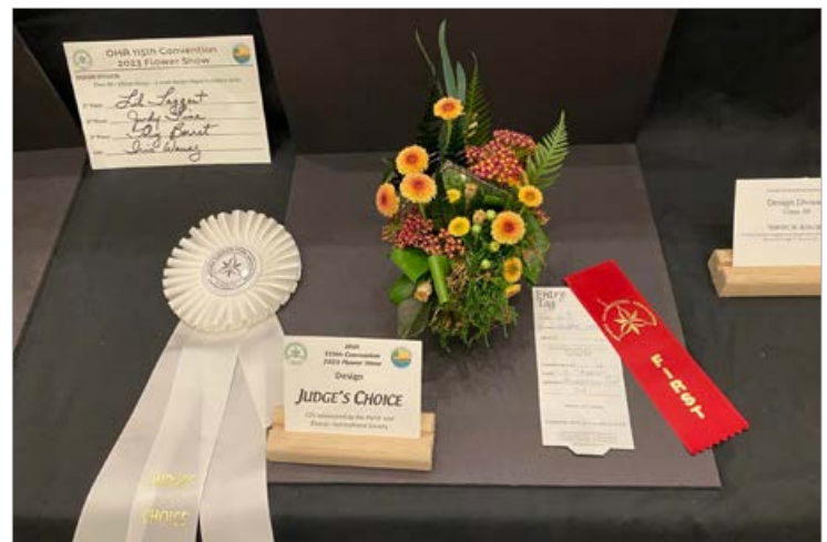
Judge's Choice – Design Division