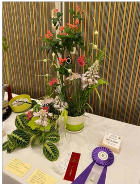
Best in Show – Special Exhibits