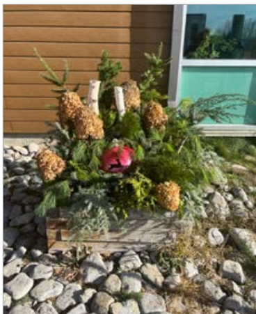
Christmas YMCA Urns

Our year closed with our AGM, a potluck and Christmas Gifts Auction. Our dependable, involved and creative members have once again brought forth their very best. They have made it possible for everyone to enjoy a marvelous evening of great food and a fun auction, the proceeds of $355 going to the local food bank. But most importantly, the priceless memories we have made together.