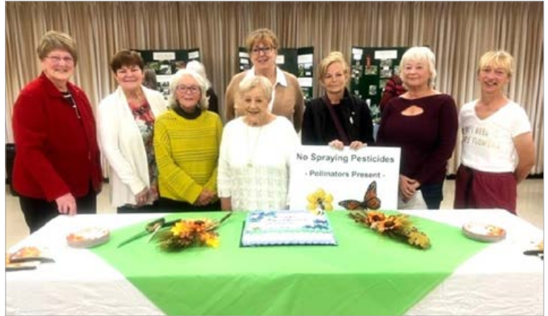
Garden Beautification Awards

Thank you to all the volunteers who assisted with the many outreach events, presentations, Society Gardens and in keeping with the vision of "100 Years and Growing".