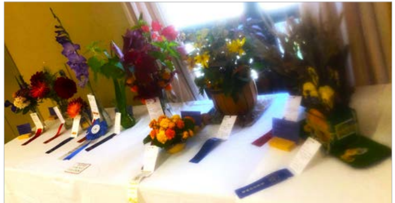
Fall Flower Show