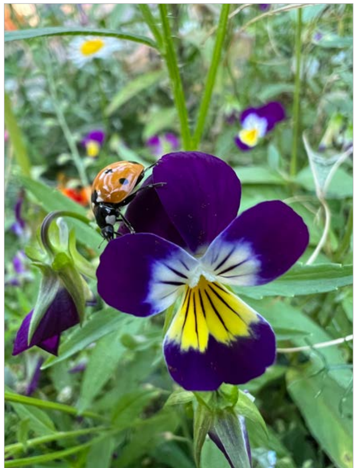
Vanessa A. #3

Purple flower contest winners