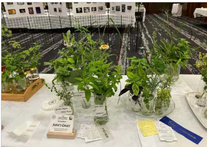
Judge's Choice – Horticultural Division